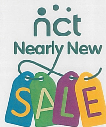
Table Top Sale Saturday 28 th September 2019

St Andrew's Church Hall, Newmarket Street, Skipton