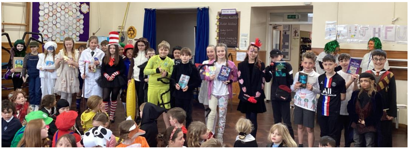
The Oompa Loompa's (staff)