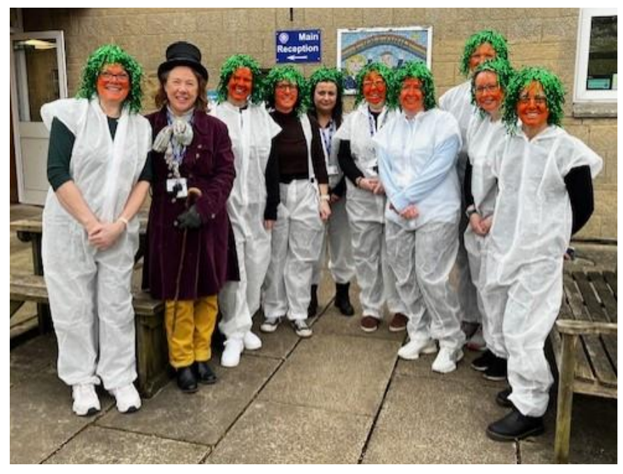
The Winners of Each Class