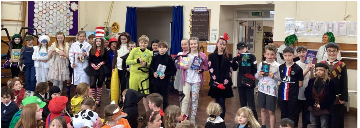
The Oompa Loompa's (staff)