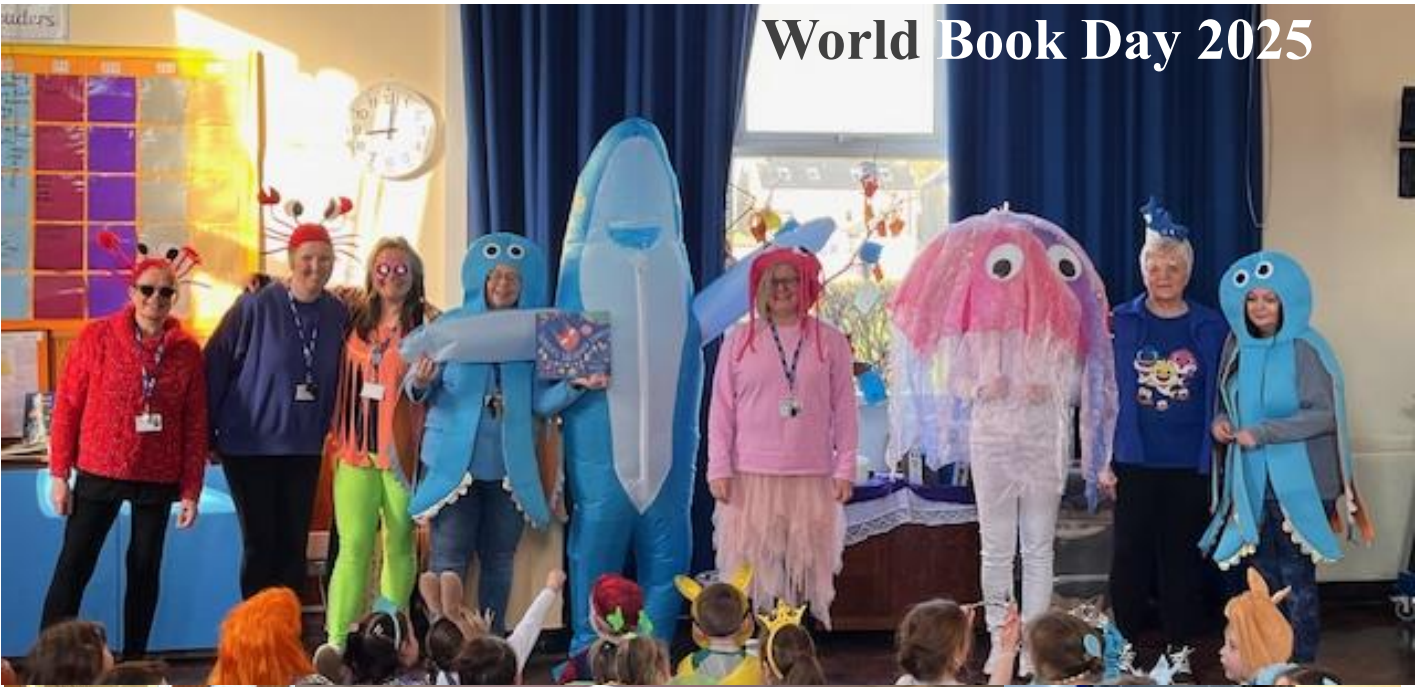
The winners with the judges